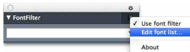
Edit font list...

This subset can be defined by clicking in the standard palette menu item (for Quark 8/9 control click into the window title).