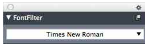
The FontFilter palette (Quark 10)

The text field shows the current active font, if any. By clicking on the popup triangle at the right a menu pops up with a list of fonts for changing the current font. The list consists of all fonts found in the document together with a subset of the system fonts.